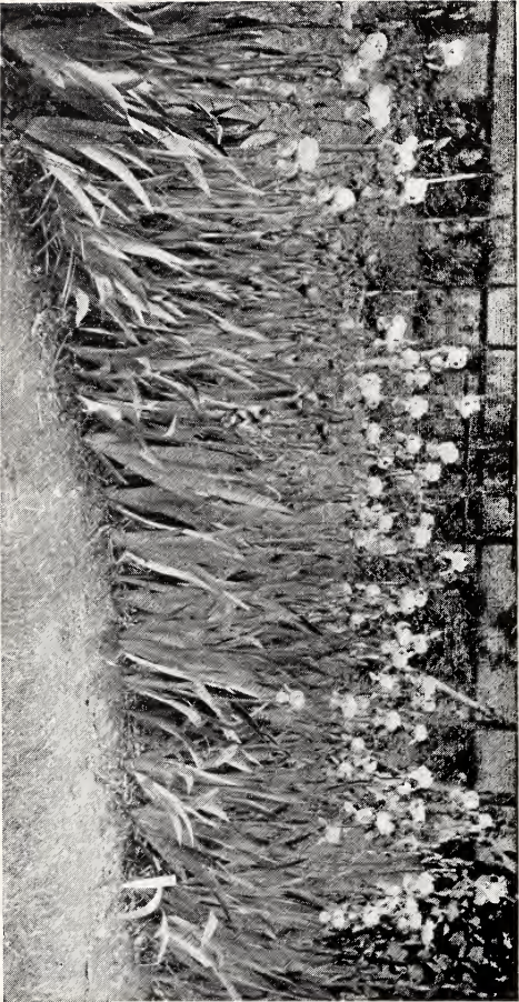
A Field of Lises